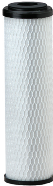
CG5-10 Replacement Cartridge: DEV9108-15